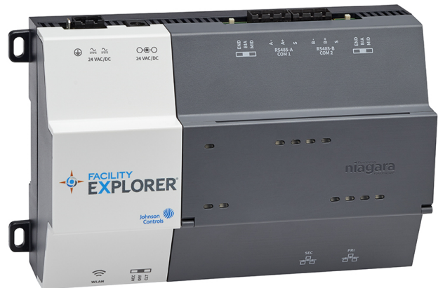
Figure 1: FX80 Supervisory Controller

If the FX80 Supervisory controller components (hardware and micro SD card) fail, place a call with Johnson Controls® Field Support Center (FSC) at 800-275-5676, or email PSOTechSupport@jci.com to determine if these components are field repairable or if one or both components need to be returned for a replacement. When the FSC has a qualified need for replacement, contact Johnson Controls Product Sales at 800-275-5676 with your FSC Help Desk ticket number, QNX number, and serial number.